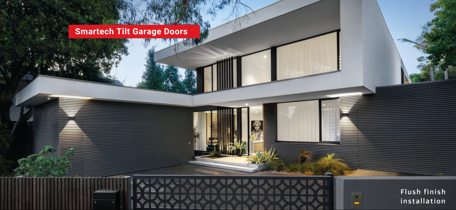
Flush finish installation