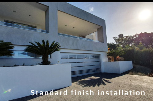
Standard finish installation